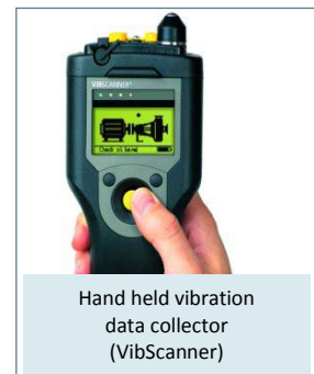
Hand held vibration data collector (VibScanner)