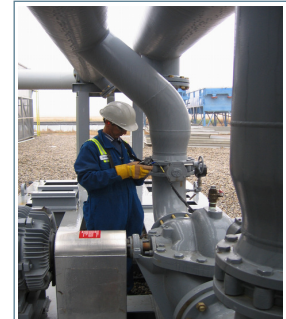
Collect vibration data and email to BETA for analysis