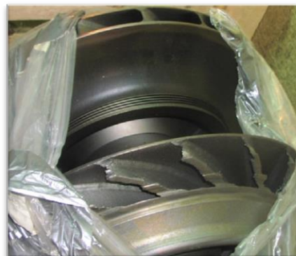
Centrifugal Compressor Damaged During Surge Event