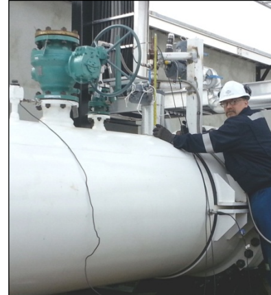
Piping Vibration Inspection Program using Multichannel Data Acquisition to assess vibration at different operating conditions

The reason for including piping vibration as part of the AIM program is due to the high risk of vibration-induced piping failures leading to significant repercussions for operators. Such repercussions include fire, safety, environmental, production, and regulatory impacts. These vibration risks are common and affect every major operator. As a general rule, the vibration integrity risk increases as the flow rates and pressures increase at a facility, or in a process stream, or when operational changes are made. More and more, asset service lives extend beyond their original design life. As a result, a facility not having a history of piping vibration problems will likely see problems as the operating conditions/life are changed.