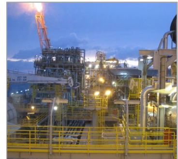
Examples where an integrated approach is used to mitigate vibration risks in the piping system, compressor and pump skids, offshore & onshore foundations, and elevated structural supports.